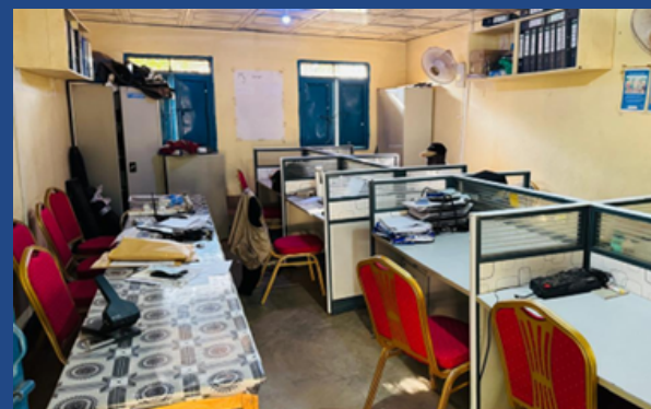
Empty MHPSS office in Maban