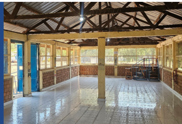
Empty Doro Day Care Center